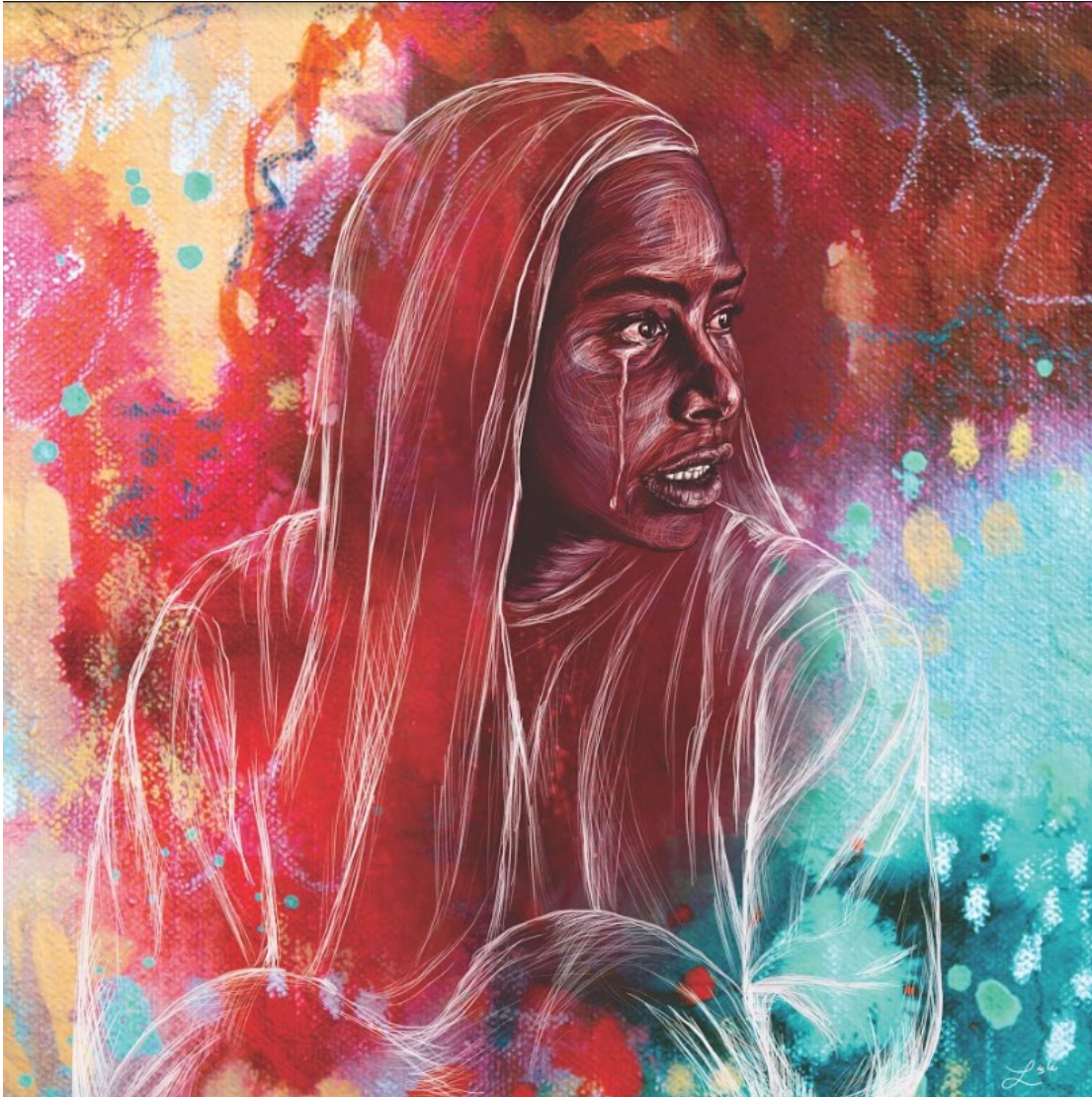
Seen / Lisle Gwynn Garrity / 1 Samuel 1:10-11 Digital Painting with Mixed Media Collage